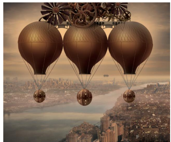
Diggle's Zepper 2016 soaring over the London skyline yesterday.

Time will tell whether Diggle's self -proclaimed brilliance is indeed brilliant, or whether it is, in fact, a load of 'hot air'.